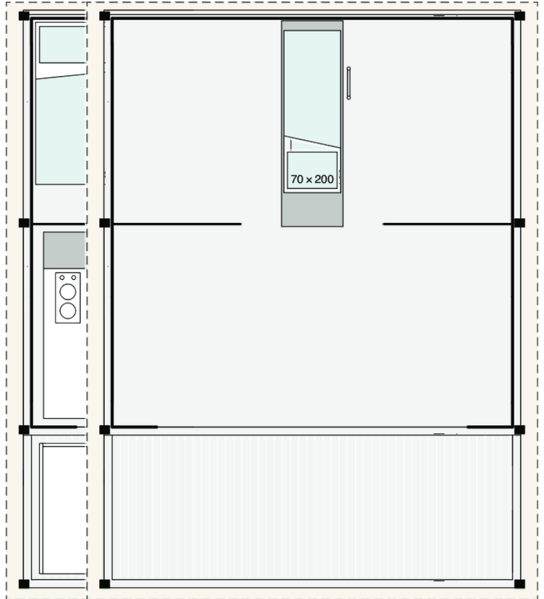
Adriatic M Comfort mansarda